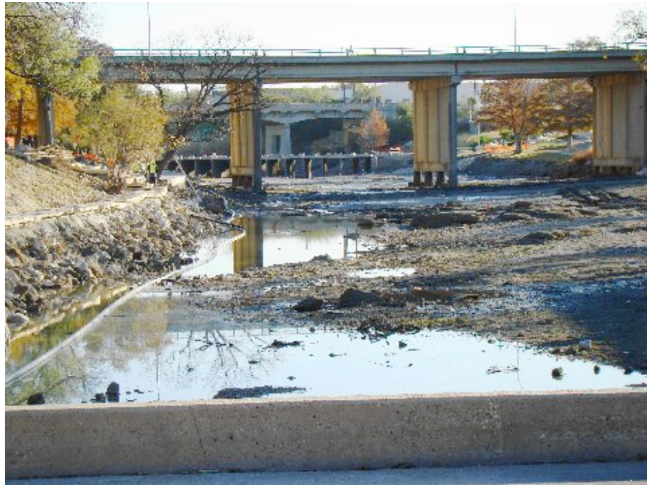
View of the Concho River (drained) from the Irving Street bridge, looking toward Chadbourne St.

Prayer: Most wonderful heavenly father, thank you for helping us know that he shall reign forever and ever. Oh what a wonderful peace this gives to us. Amen and Amen.