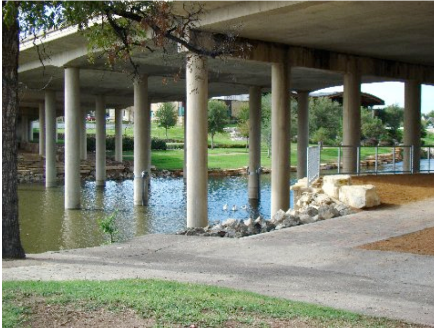
Looking toward Visitor's Center underneath Koenigheim St.