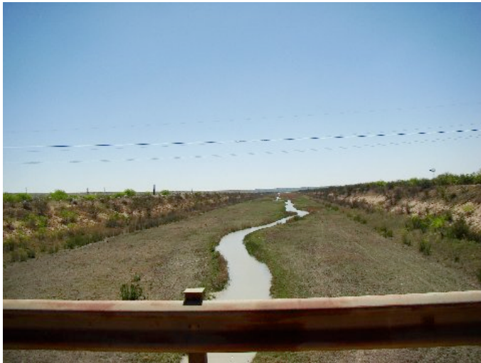
View of the equalization channel at Twinn Buttes Reservoir

Wednesday 4 December 2013 Micah 5:2 Karen Bartholomeo