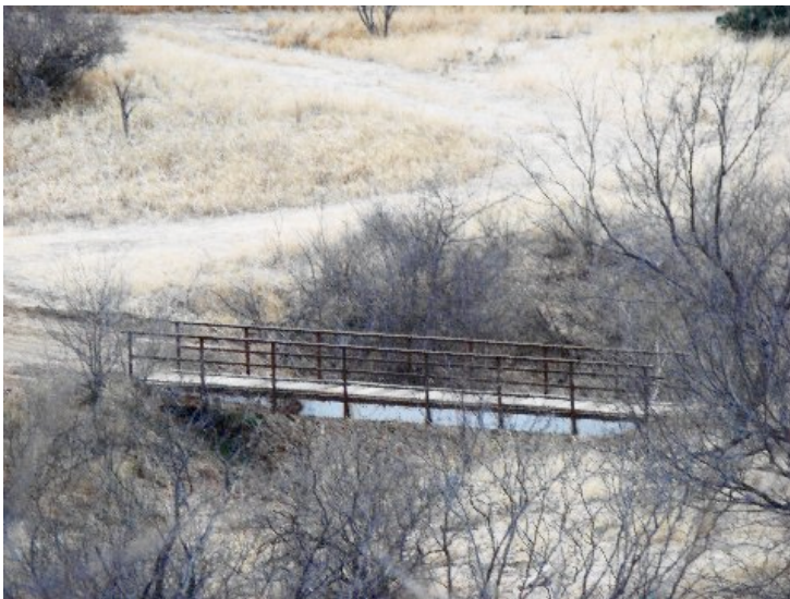
Bridge below Pulliam Point at San Angelo State Park

With Abraham starting his family and increasing it for God is declaring we on earth will have the blessing of the coming of his son, Jesus. The prophecy, promise and real happening is his will for us to follow in our Christian religion.