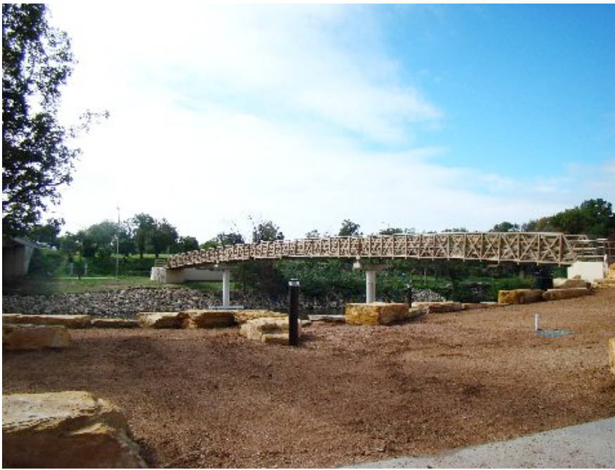
Bridge leading to Sunken Gardens from near Kid's Kingdom on the Concho River