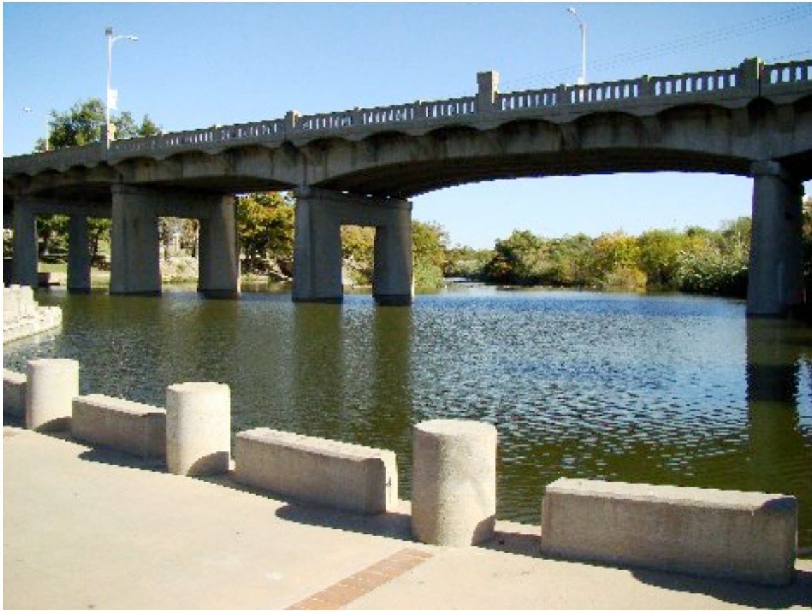
Pictured: Oakes St. Bridge from the Celebration (Mermaid) Bridge on the Concho River