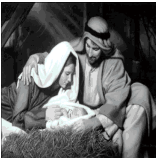
"Jesus Christ: God WITH Us"

2014 will be the year we... talked WITH God and... walked WITH God... EVERYDAY.