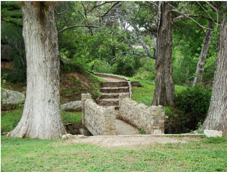
Bridge at the Bridal Path behind the Lily Garden

Judah was far from perfect either. But, on two different occasions he saved two of his brothers, once by offering his own life for trade of his brother's. I see this as qualities