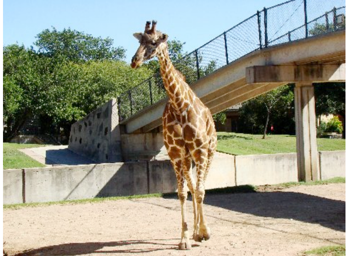
Bridge at the giraffe enclosure at the Abilene Zoo

Use the tools and grow more like Jesus. Don't use them, and you will not grow and be blind. You will forget that Jesus died for our sins.