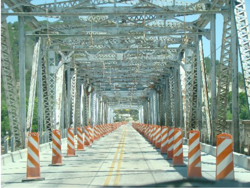
Interior view of bridge in Junction, Texas

Monday 16 December 2013 Isaiah 11:1 Ella and Kente Nichols