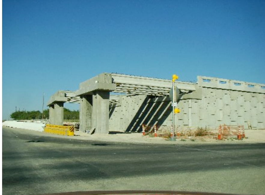
Bypass under construction in East San Angelo

Prayer: Lord, let me hear what you are saying, while I am waiting. Amen