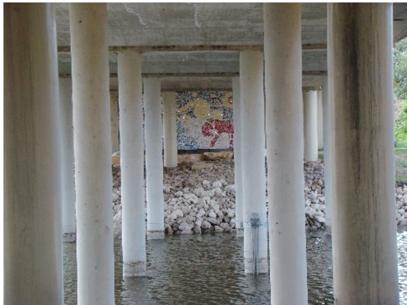
Public art beneath a downtown bridge over the Concho River

NO MATTER HOW HIGH ON THE CHAIN OF COMMAND YOU THINK YOUR ARE, YOU ARE NOT IMMUNE FROM BEING UNJUSTLY PERSECUTED. WHEN YOU HAVE THE HEAD CHIEF (GOD) IN COMMAND ON YOUR SIDE, YOU WILL ALWAYS BE PROTECTED AND LOVED. DO NOT BE AFRAID: GOD LOVES YOU AND HATES THE WICKED.