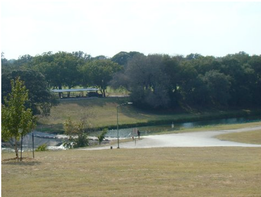
Low water crossing at picnic area in Junction, Texas

Tuesday 17 December 2013 Isaiah 9:1-2 Gary Elmquist