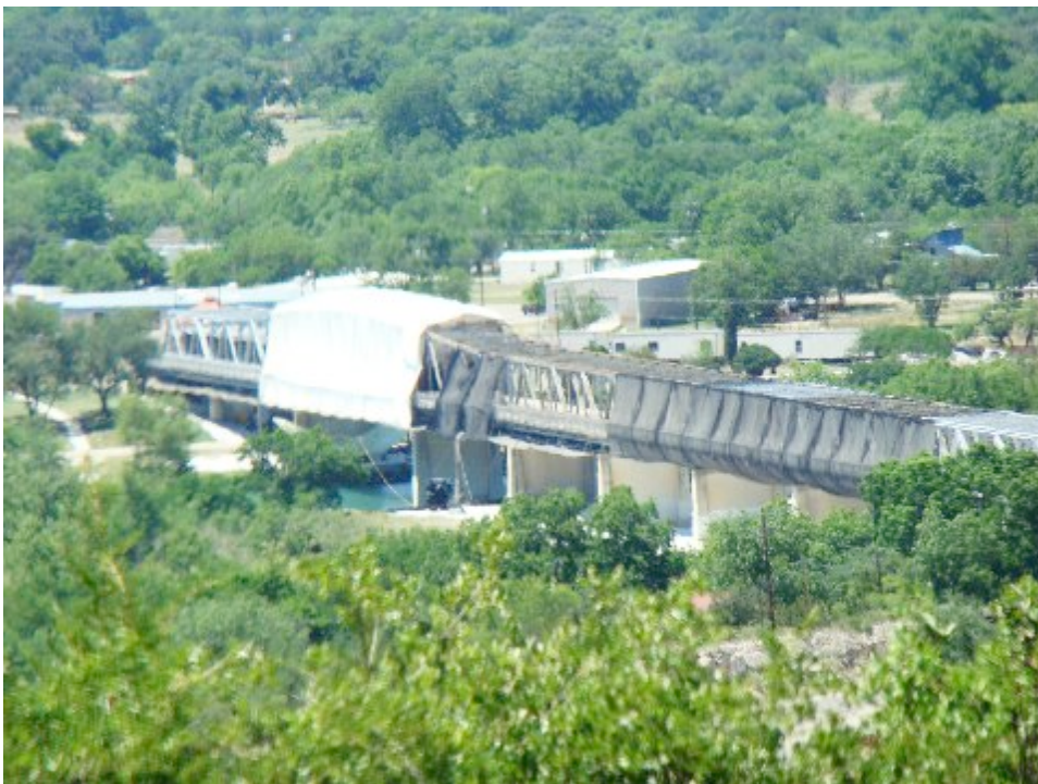
Bridge in Junction, Texas being repaired

Heavenly Father, we pray that we never forget your grace and mercy, that we share it with others as you did. And never expect anything in return or recognition. Amen