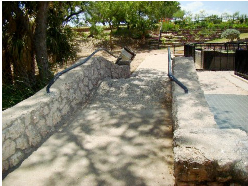
Bridge at the Lily Garden