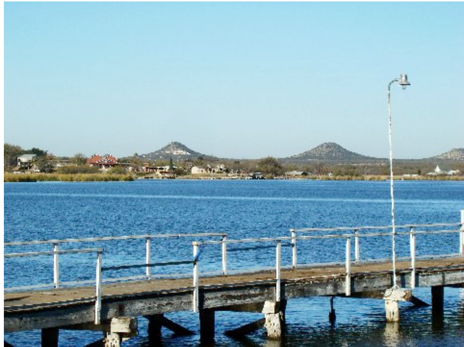
Pier at the nature center, viewing Twin Buttes across Lake Nasworthy

The information regarding Jesus' family lineage, the family's marital status, and the reason that the family was in Bethlehem are laid out simply in these few verses and point out the humble circumstances of the family who were about to bring